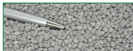
Granular single superphosphate