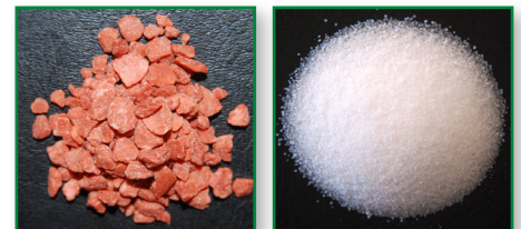
Potassium chloride is found in various shades and particle sizes.