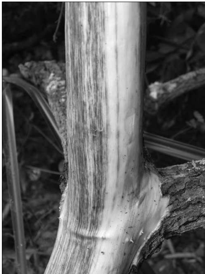
Figure 3. Black discoloration in the outer sapwood of a redbay tree 6 weeks after artificial inoculation with the laurel wilt pathogen, Raffaelea spp.

∇ Among trees inoculated with Raffaelea spp., the proportion of trees from which Raffaelea spp. was reisolated significantly differed between the propiconazole group and the untreated group ( \chi^2 = 13.33 , P = 0.0003 ).