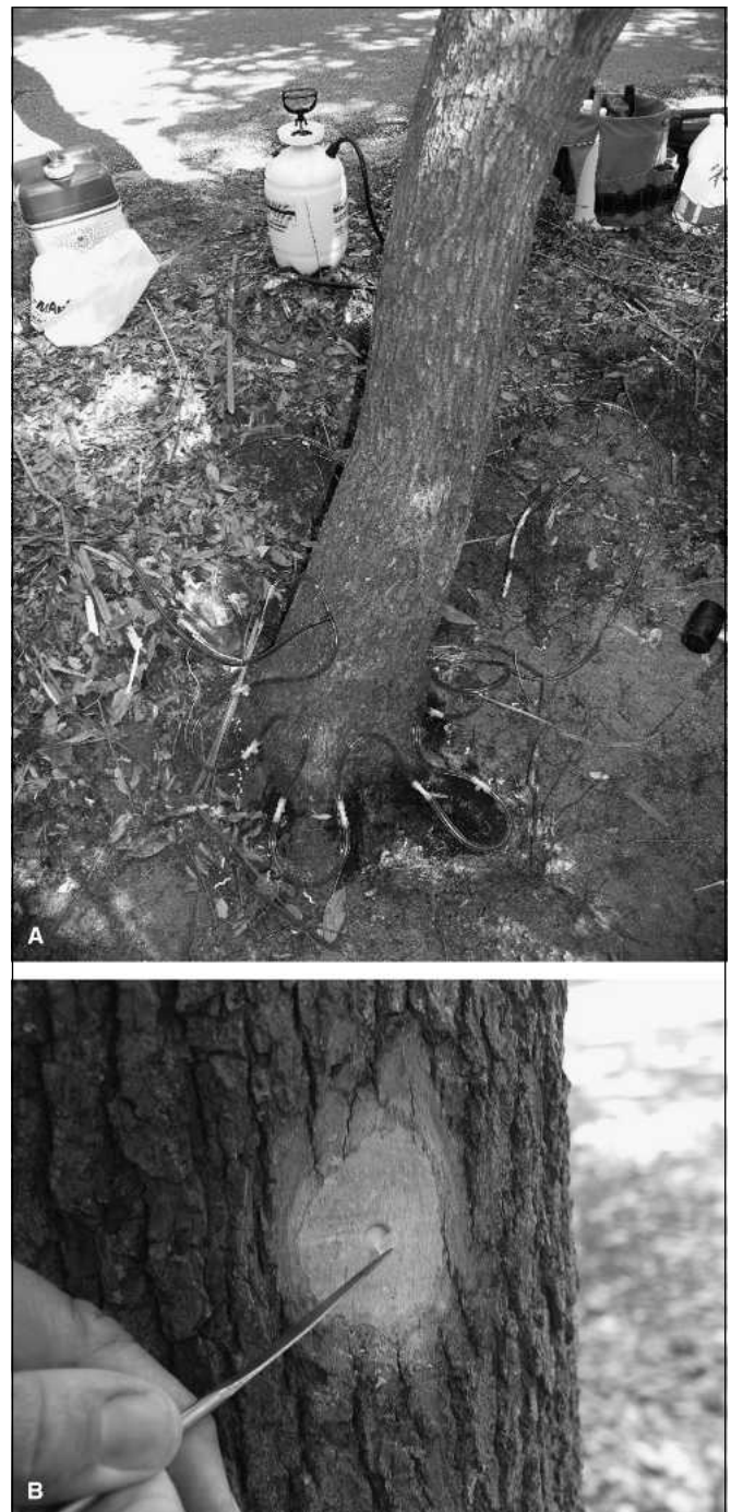
Figure 1. Macroinfusion of redbay tree with the fungicide propiconazole (A). Inoculation of redbay trees by placing an agar plug with the laurel wilt pathogen ( Raffaelea spp.) into a hole in the outer xylem (B).

On 19 April 2007 (2 to 3 weeks after fungicide injection), all 20 trees (fungicide-treated and control trees) were inoculated with Raffaelea spp. Two isolates of the fungus were used, one from Ft. George Island, Florida (FG) and one from Hilton Head Island, South Carolina (HH5) (isolates provided by S.W. Frae-