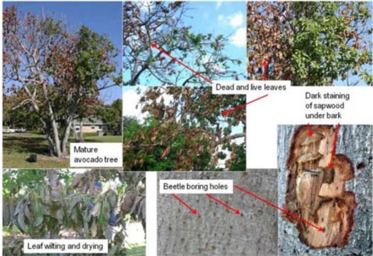
Photo. 2. Symptoms of a mature avocado tree that tested positive for laurel wilt and redbay ambrosia beetle in Brevard County.

More information on the laurel wilt-redbay ambrosia beetle may be found at: