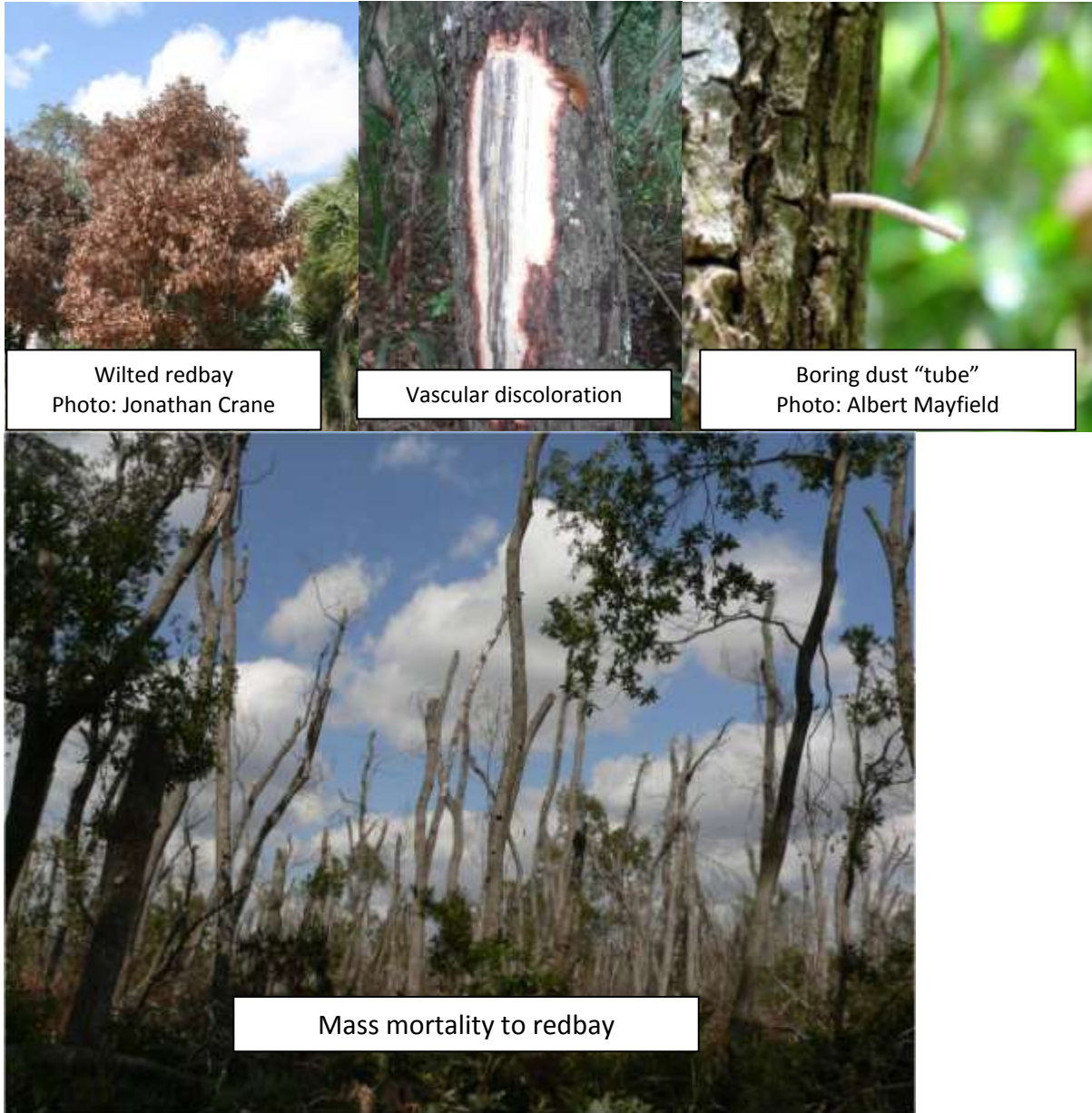
Photo. 1. Leaf, wood, and bark symptoms of laurel wilt and redbay ambrosia beetle attack of redbay trees.