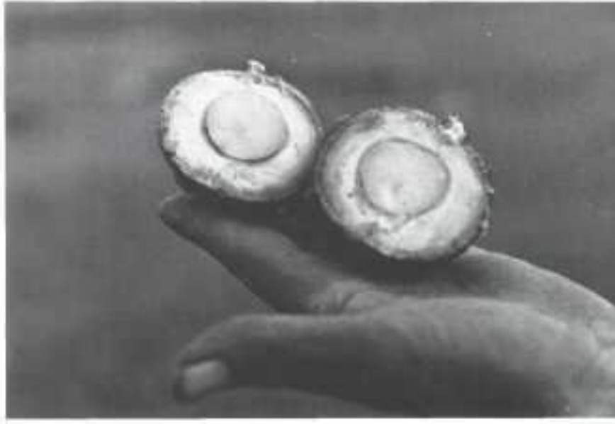
Fig. 4. Fruit of Aguacate de Mico photographed in Santa Maria de Ostuma in Matagalpa region in Nicaragua