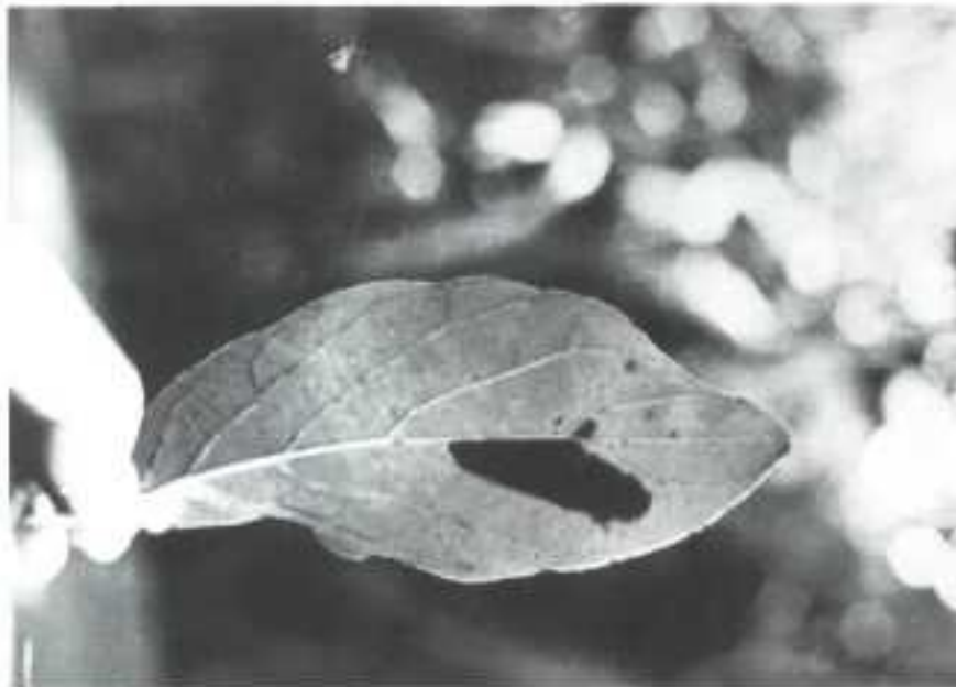
Fig. 2. Leaf of Aguacate de Mico showing its characteristic shape and venation.