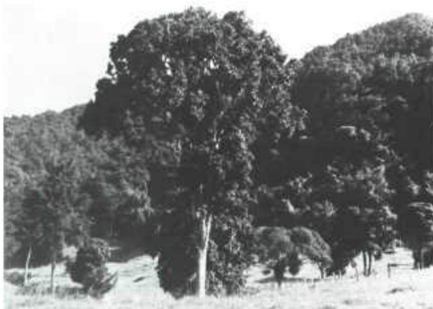
Fig. 3. Tree of Aguacate de Mico photographed in Santa Ana volcano in El Salvador.