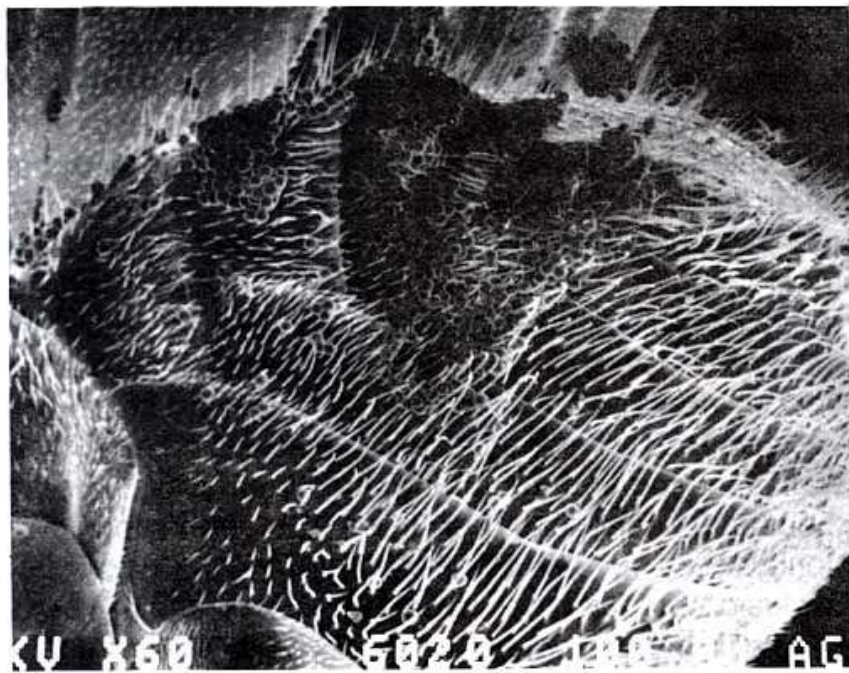
Figure 3. A hind leg of Geotrigona acapulconis carries avocado pollen load at the beginning stage of guilding up. SEM picture, x 100.