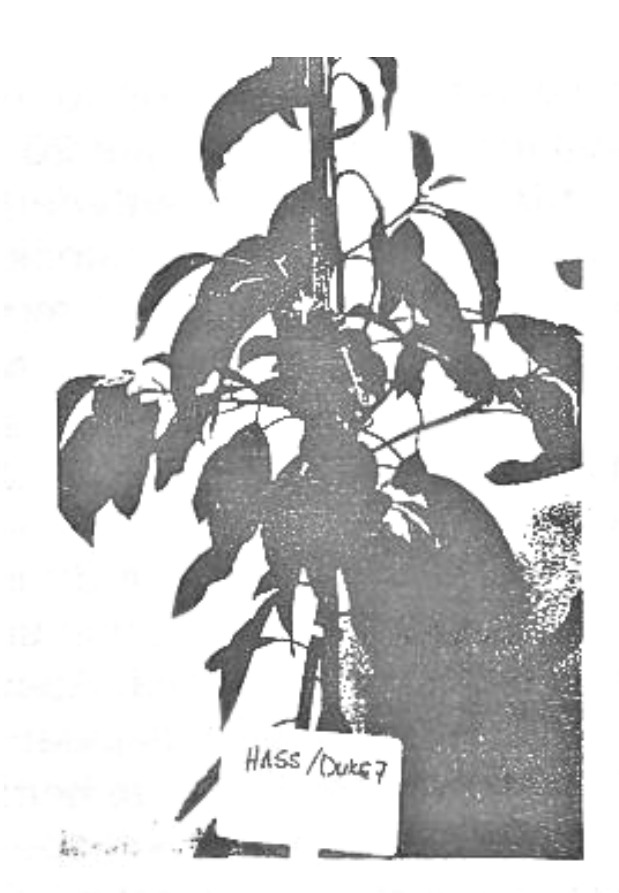
Figure 2. Young nursery tree