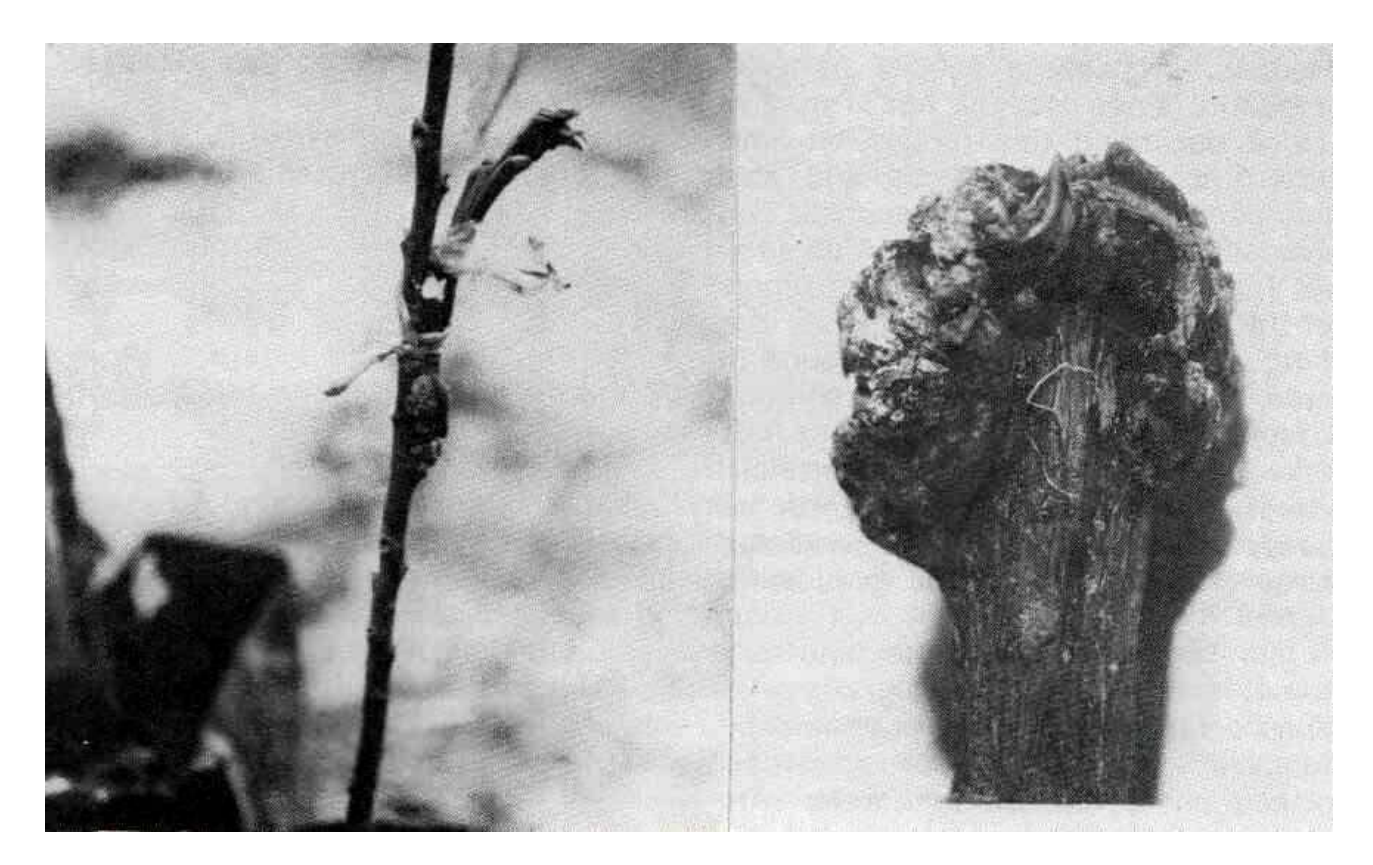
Fig. 2. Young grafted tree with tumor growth at the junction (left). Stem cut transversally with tumor growth (right). Dark pycnidia are present on the tumor surface.