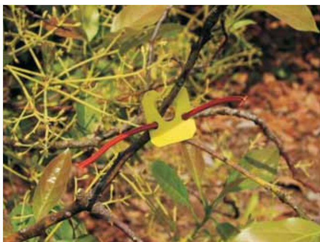
Figure 1. An example of pheromone dispensers used during this trial to reduce false codling moth damage

Mating disruption with the product Isomate proved to be effective during the 2006/07 season and this trial was done to reconfirm these results. Male false codling moths largely use pheromones to locate females. This will only work if the male has to move against a gradient of increasingly higher concentrations of the pheromone. The Isomate pheromone dispensers ( Figure 1 ) work by saturating the orchard environment with a synthetic derivative of the false codling moth sex phe-