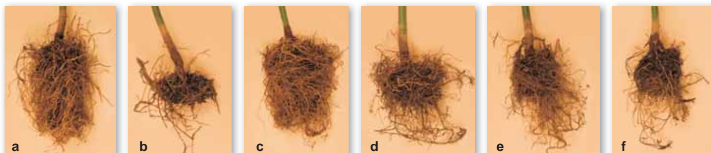
Figure 3: Representative samples of the root system of avocado trees inoculated with P. cinnamomi and subjected to various treatments from experiment 4. From left to right: uninoculated, untreated tree (a); inoculated, untreated tree (b); uninoculated, silicon treated tree (c); inoculated, silicon treated tree (d); inoculated, potassium phosphonate treated tree (e); and a tree treated one day before inoculation with silicon (f).