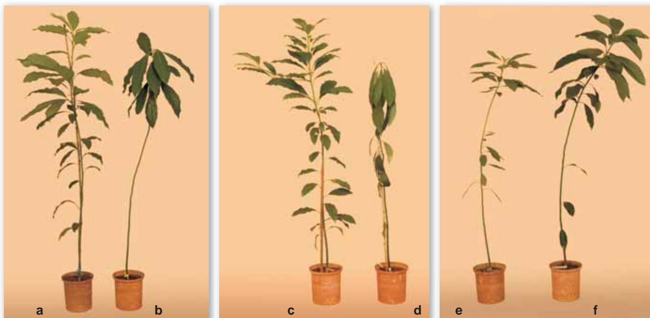
Figure 1: Representative trees from the various treatments illustrating the canopy condition of avocado trees inoculated with P. cinnamomi during experiment 4. From left to right: uninoculated, silicon treated tree (a); inoculated, potassium phosphonate treated tree (b); uninoculated, untreated tree (c); inoculated, untreated tree (d); tree treated one day before inoculation with silicon (e); and inoculated and silicon treated tree (f).

All data were analysed using Genstat® 4.23 DE for Windows®. A general analysis of variance was performed for each data set and means. Standard errors of the means and LSD's at the 5% confidence level were calculated.