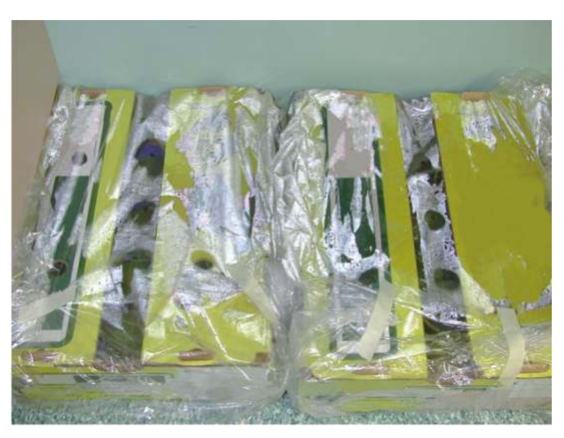
Figure 1. Trays of avocados in polyethylene bags before removal and placement into storage.

Avocado fruit cultivar 'Hass' were harvested from one commercial orchard in the Bay of Plenty (37°S, 176ºE). Eight hundred fruit were harvested each on the 19/1/2004, 13/12/2004, and 14/2/2005. Within 30 minutes of harvest the ungraded fruit, average weight 226.72g, 260.91g, 254.57g respectively, were weighed and packed into trays of 10 fruit. The trays were randomly divided into two lots of 40 trays each. One lot of 40 trays was not placed into bags. One lot of 40 trays was placed into high humidity where the fruit stored on their cardboard plix trays within a single layer tray. The trays were placed into a 25µm polyethylene bag, 605mm wide by 705mm long before storage (Figure 1). Trays were left in bags until placed into storage. Bags were loosely sealed by folding over the open end of the bags and securing with