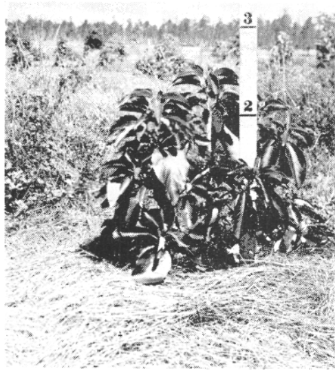
Fig. 2. Tree 3 D surrounded by grass mulch on May 26, 1950.