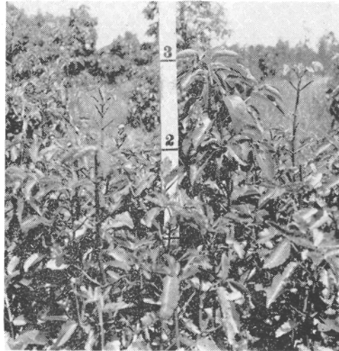
Fig. 5. Tree 17 E surrounded by Bryophyllum on May 26, 1950. Note the large avocado leaves by the stake and above the Bryophyllum. To the left is the clump of Bryophyllum surrounding tree 18 E.