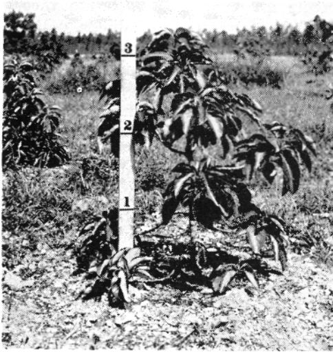
Fig. 1. Tree 1 E in the hoed plots on May 26, 1950. The tree to the left is 2 E in the shavings mulch plot. The indistinct tree to the right is 7 E.