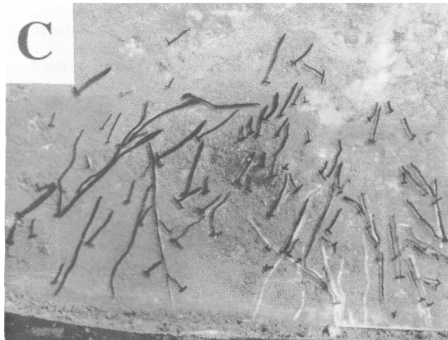
Fig. 1. A) Diagram of rhizotron used to monitor growth cycle of avocado shoots and roots. The transparent plexiglass face in each rhizotron was in direct contact with soil and roots and was exposed to light only when root growth was recorded. B) Viewing face of one of the rhizotrons showing the extent of root growth when root growth measurements began. C) Viewing face in B) showing manner in which individual roots and the position of root tips were noted on templates during each root measurement (nonmarked roots did not have tips that were visible on the face).

Shoot and root growth measurement. Linear extension of shoots and roots in each rhizotron was measured every 710 days for an entire calendar year. The number of shoots and roots that were measured on a given plant varied during the experiment due to changes in plant size, shading of shoot terminals, root mortality, growth of roots out of the field of view on the rhizotron face and other noncontrollable factors. On a given sample date, extremes of 2 and 39 shoots (mean =14) and 0 and 51 roots (mean = 6) were measured per plant.