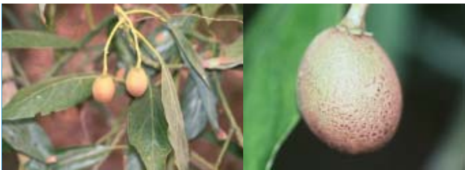
Economic losses from avocado thrips are the result of scarring on immature fruit by larvae and adults. Impacts include feeding damage, left, and alligator skin, right. While the edible flesh of avocados that mature with thrips damage is usually healthy, scarred fruit is often downgraded at the packinghouse.

Cultural and biological control. Combined field and laboratory studies indicate that approximately 77% of S. perseae larvae drop from avocado trees to pupate in the upper 2 inches of leaf duff beneath the tree canopy, before emerging as winged adults that fly back up into the canopy to commence feeding and reproduction. One strategy for increasing thrips pupation mortality rates beneath trees is to use composted organic yard waste for control of avocado root rot ( Phytophthora