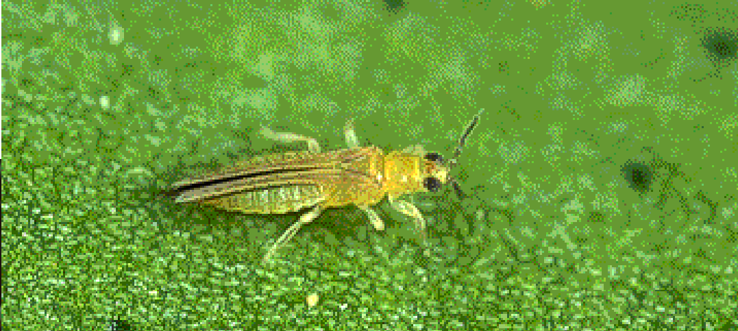
Avocado thrips, above (adult female), were first discovered in California in 1996. They have since become a major pest, with 80% of commercial orchards reportedly spraying to control them. On maturing fruit, left , avocado thrips cause elongate feeding scars.