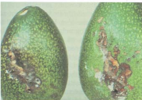
Amorbia damage to Bacon avocado