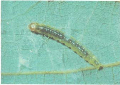
Amorbia cuneana larva

of those within the omnivorous looper egg clusters were not.