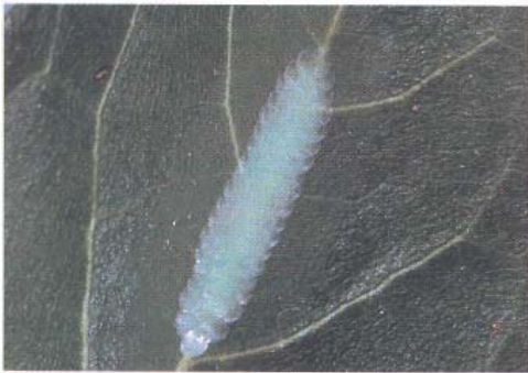
Newly laid Amorbia egg mass