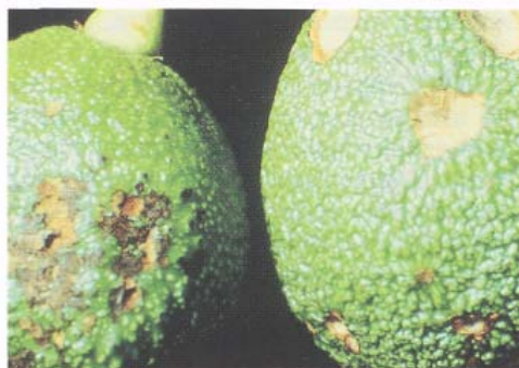
Looper damage to Hass avocado

In additional studies, egg masses/clusters of both pest species were obtained from laboratory cultures and artificially attached to the foliage. More than twice as many A.