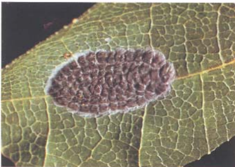
Parasitized Amorbia egg mass