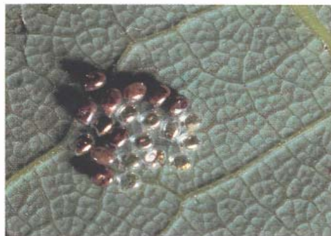
Parasitized looper egg cluster