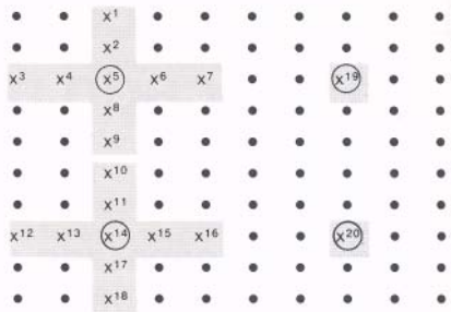
Fig. 1. Von Essen avocado orchard.

and 2) at 50,000 per tree for a total of 200,000 per acre. Most avocado groves in California average 100 trees per acre. The source of T. platneri was a commercial insectary where the parasite had been mass-produced with Sitotroga cerealella (Oliver) eggs as the host.