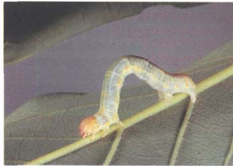
Omnivorous looper larva