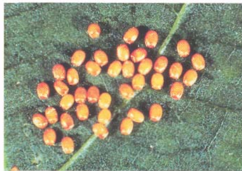
Omnivorous looper egg cluster