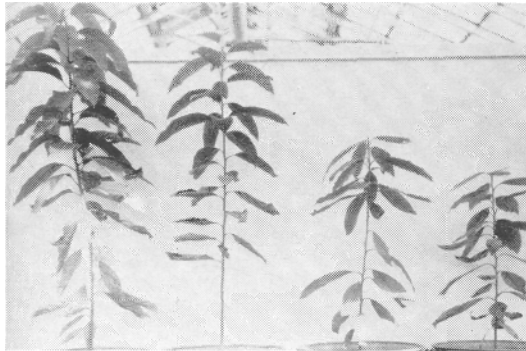
Growth of Topa Topa—Mexican—avocado seedlings in sand cultures provided with drainage when the culture solution contains a very high concentration of chloride as calcium chloride in addition to the major and minor nutrient elements. To this culture solution was added: Culture No. 1—extreme right—nothing; No. 2, ammonium nitrate; No. 3, ammonium sulfate; and No. 4—extreme left—ammonium di-hydrogen phosphate. The added ppm of nitrogen—111.3 ppm—in Cultures Nos. 2, 3, and 4 are the same.

No. 1, nothing; No. 2, ammonium nitrate; No. 3, ammonium sulfate; and No. 4, ammonium di-hydrogen phosphate. The added ppm of nitrogen—16.7—in cultures Nos. 2, 3, and 4, are the same.