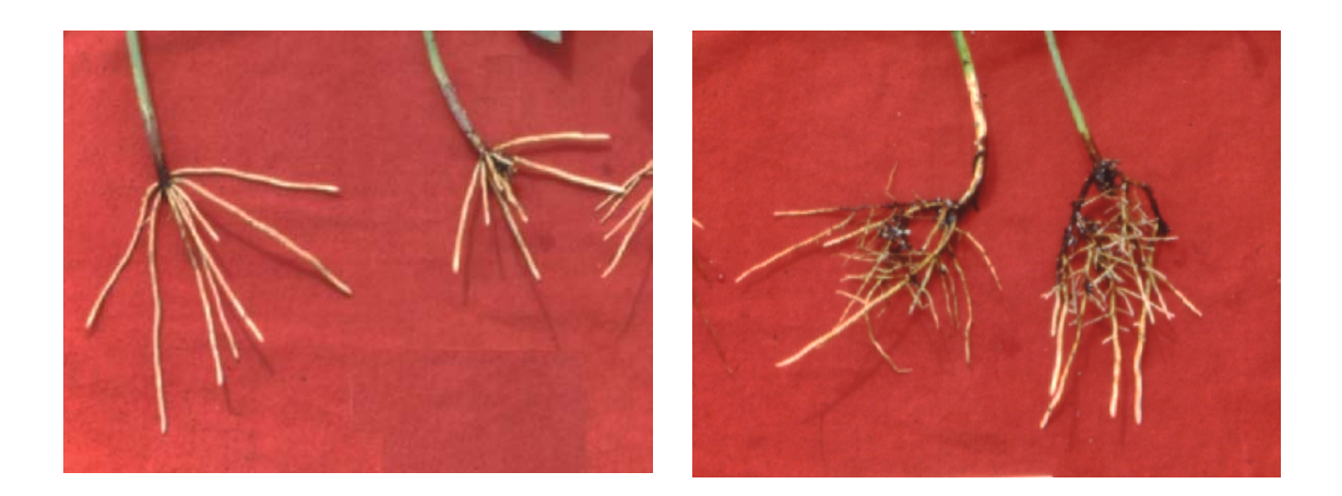
Figure 4. Adventitious root system of cloned avocado items differing in morphological root characteristics.