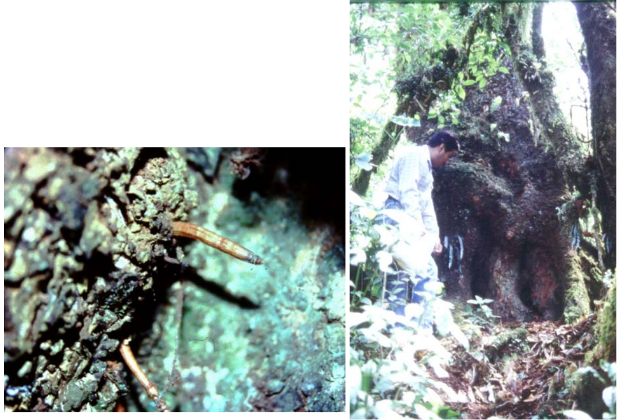
Figure 3. Adventitious roots emerging from a damaged main trunk of Persea steyer-marki and the author beside a tree showing restored new adventitious root system after growth for many years. This wild species is dominant in a forest near San Cristóbal de las Casas, Chiapas, México.

The conservation of the avocado genetic resources can be in situ or ex situ . The first option is in the natural environment, this could be the ideal for preservation but it has the inconvenience that it is exposed to fire, drought, and other factors that can destroy them, even if they are situated in protected areas. The ex situ orchard conservation is the most used method in fruit species, but the challenge for many genebanks of avocado is to get sufficient funding to continue in the preservation of the invaluable gene pools. During the World Avocado Congress IV in Uruapan, Mexico in October 1999, a Workshop dealing with avocado genetic resources was held, in which it was decided to gather an international avocado genebank with the direct participation of the International Avocado Society. If this efforts succeed it will generate many possibilities for the world avocado industry of the future. Only international cooperation can make this dream a reality. We must search for funding to create this international genebank of avocado, if we do not take action soon the resources will be lost forever.