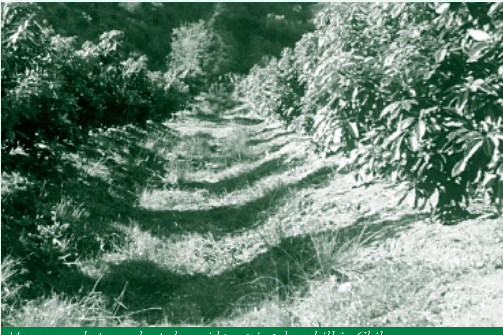
Hass avocado trees planted on ridges going downhill in Chile.

the U.S. and that it will likely remain the principal market in the future. In the meanwhile the Chilean avocado industry is experiencing a boom. Average FOB prices for the 2000-2001 season were $22 per lug. This season is likely to produce average FOB returns greater than $24.