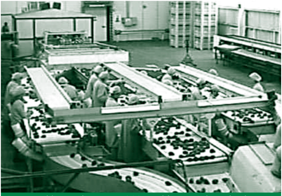
Overview of fruit grading using HACCP guidelines at Safex Packinghouse near Quillota, Chile.

year, when commercial harvest commences, a grower with a 25-acre grove will have invested around $4,000 per acre.