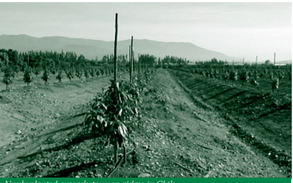
Newly planted avocado trees on ridges in Chile.