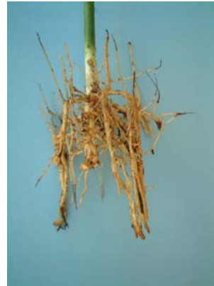
Fig. 3 Successful growth of "collar of roots" on 'Velvick' following 360°wound.