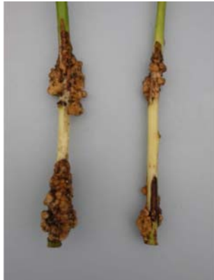
Fig. 2. Excessive wound callusing on 'Velvick'.

wound treatments. 'Velvick' (West Indian) was the most difficult rootstock to root. In most instances a large mass of callus tissue grew at the wound site (particularly with the three cutting wounds) with either very sparse or zero root growth (Fig. 2). The 360° scrape wound gave the most consistent result with 'Velvick' (Fig. 3) although not all plants treated this way produced good root systems. From these results it is obvious that further research is required with 'Velvick' to develop cloning methodology sufficiently robust for commercial application. Aspects that can be further investigated are KIBA concentrations and temperature regimes during rooting.