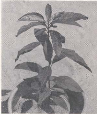
Fig. 1. Zutano avocado seedling showing necrosis of leaf tips and margins after fumigation with reaction products of ozone and 1-N-hexene vapor (synthetic smog).

New avocado leaves produced in the presence of clean air averaged 35 per cent larger than did leaves produced by seedlings fumigated with synthetic smog (Fig. 2, Table 1). Differences in new leaf area were not apparent during the early part of the fumigation period but became progressively more pronounced near the end of the eight-week fumigation period. The general leaf shape was not altered, the ratio of length to width remaining identical for fumigated and nonfumigated seedlings. The new avocado leaves became progressively more chlorotic as the fumigations continued and appeared somewhat rugose in comparison with leaves of nonfumigated seedlings.