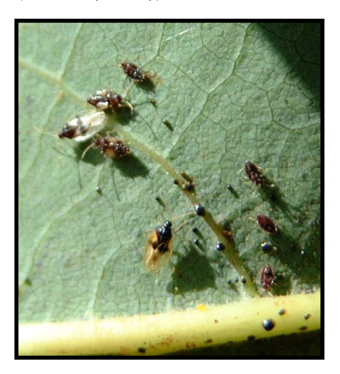
Figure 1. Avocado lace bug colony on the underside of a leaf with winged adults, globular black eggs, and reddish-brown nymphs at various stages of development.