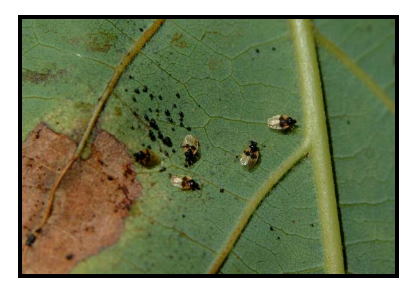
Figure 3. Feeding by avocado lace bug initially causes stippling and bleaching of the leaf because the insect removes the contents of individual leaf cells. Feeding damage is visible from the upper leaf surface. Eventually this damage results in islands of completely dead (necrotic) leaf tissue (Photo: Guy Witney).

Figure 2. Adult avocado lace bugs laying eggs on the underside of an avocado leaf to initiate a new colony adjacent to damage caused by previous feeding (brown leaf area on the left of the photograph). Adult avocado lace bugs seldom fly from the surface of the leaf even when disturbed (Photo: Guy Witney).