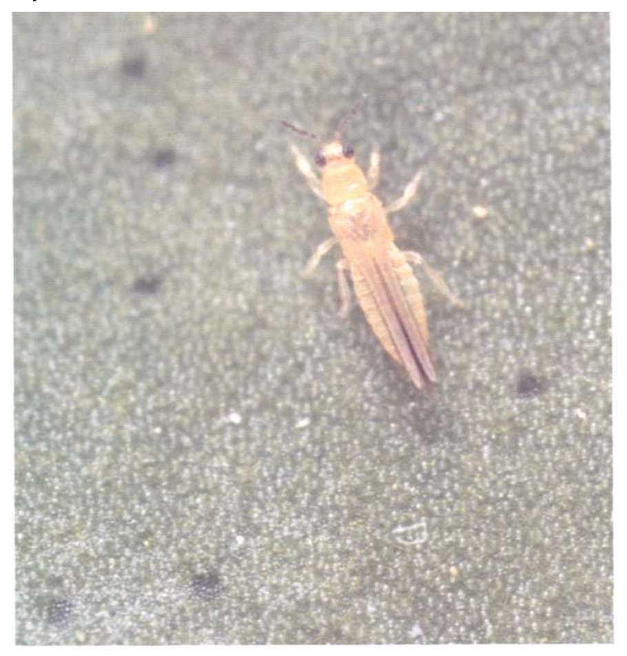
Avocado thrips, Scirtothrips perseae

the type of adhesive on the trap or card. Many insects show color preferences which influence orientation and landing behaviors. Thrips have been shown to be most attracted to sticky cards that are either white, yellow, or blue in color (Childers and Brecht, 1996). Sampling with sticky cards for various species has been used to assist with pest control decisions, and for monitoring pest and natural enemy population trends throughout the year.