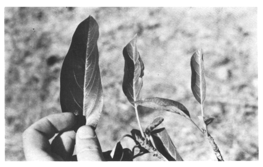
Figure 3. Normal size avocado leaf (in hand), compared to the frequently reduced size leaf (right) of a P deficient tree.

Tables 2 and 3 reflect conditions in Grove No. 1 prior to the beginning of this experiment. Table 2 indicates low nitrogen and P in the leaf tissue of the poor trees, relative to the healthy trees in a different part of the grove.