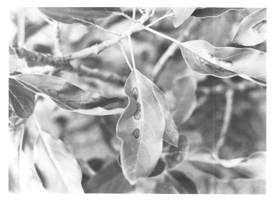
Figure 6. Randomly distributed patches of necrosis on the leaves of phosphorus deficient trees.