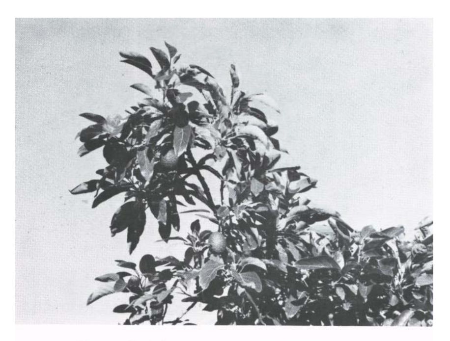
Figure 4. Typical top growth of mature, P treated trees.

The data from 1982 to 1984 in Table 4 exemplify the decline of leaf F from 0.11% to 0.06% as being concurrent with the change in soil pH iron 6.1 to 3.6. The soil acidification, in turn, is related to the use of inexpensive ammonium-derived fertilizers in conjunction with a low alkalinity (Lake Cuyamaca) irrigation water.