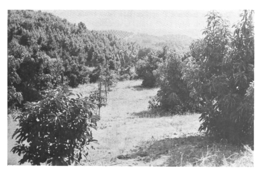
Figure 1. Growth response of a nitrogen-only row (left) and an ammonium phosphate row (right).

growth and the trees are declining. To date, the addition of K with P has shown no benefit over P alone.