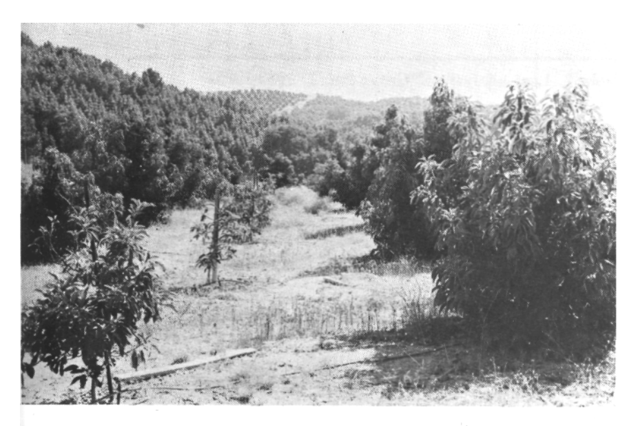
Figure 2. Growth response of a nitrogen-only row (left) and a nitrogen, phosphorus, and potassium row (right).

Figure 3 shows a normal size avocado leaf (in hand), compared to the frequently reduced size leaf (right) of a P deficient tree. The randomly distributed patch of necrosis typical of P deficient leaves from greenhouse experiments is also shown in Figure 3, but it is seldom found in this grove.