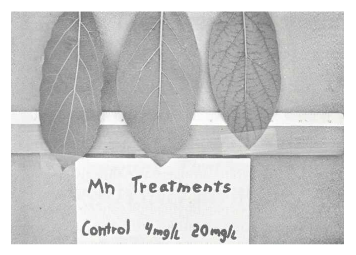
Fig. 2. The appearance of Mn toxicity symptoms on the bottom surface of avocado (eaves as a /unction of solution Mn concentration.

concentrations in excess of 1000 mg/kg in their leaves on a dry weight basis, and are geographically centered in an area south of Fallbrook, where soils are derived from volcanic rocks rich in Mn.