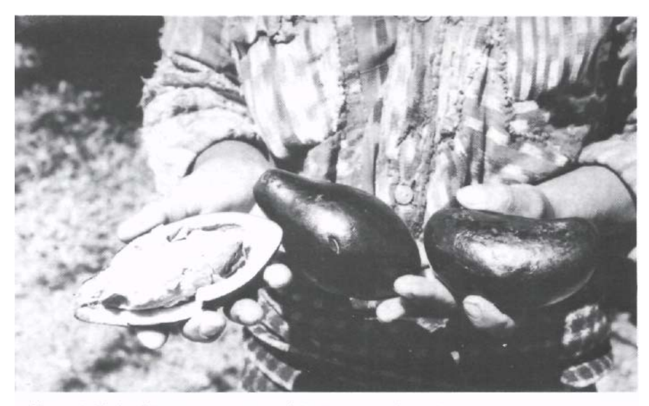
Figure 5. Fruit of "Anay," a species of Beilschmedia from Guatemala; this is similar to some of the wild species of Persea .