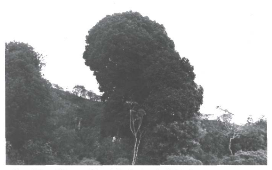
Figure 2. Tree of Persea nubigena in the Guatemalan highlands.

Three different types of Beilschmedia were found growing in warm regions of Guatemala, El Salvador, and Costa Rica. It is not a true Persea , but its fruit resembles a wild avocado. Popenoe found the first trees ( Beilschmedia anay ) in the Pacific coast of Guatemala and had a great interest in this collection. Another species Beilschmedia ovalis , grows on the slopes of a volcano in Costa Rica.