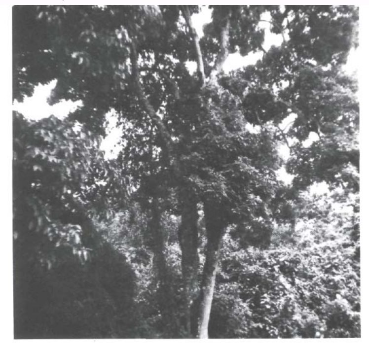
Figure 6. Tree of "Aguacate de Mico," a possible ancestor of the Guatemalan criollos.