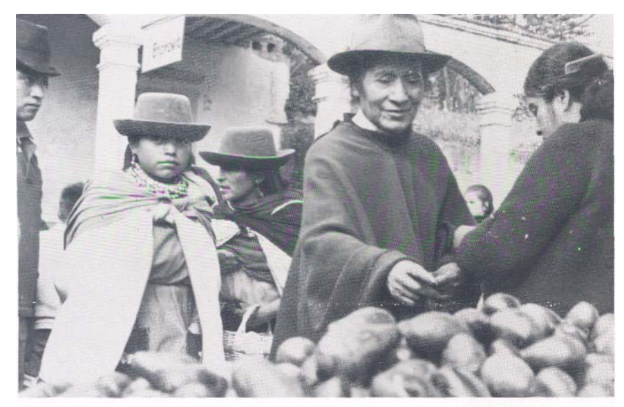
Figure 3. Market scene in Otavalo, Province of Imbabura.