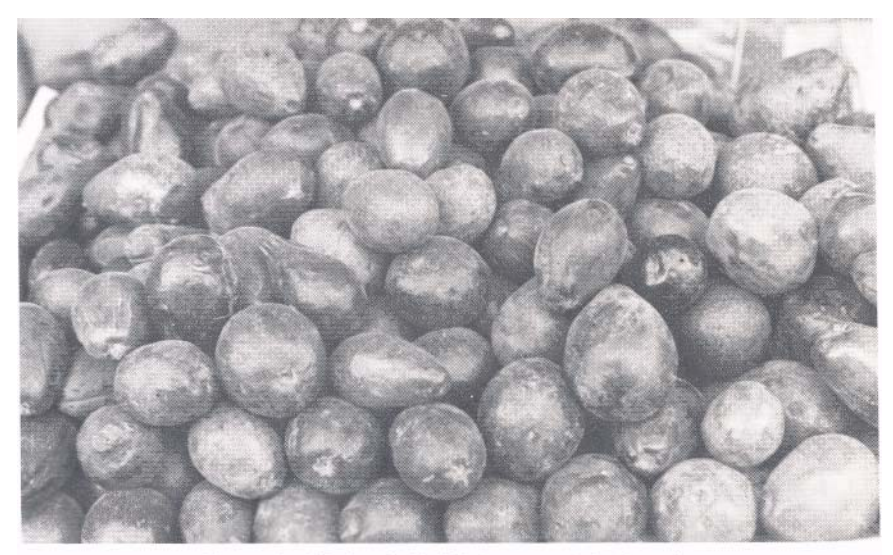
Figure 4. "Nacionales" (Mexican race) in Otavalo.