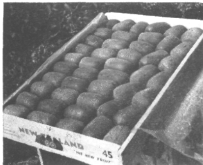
Figure 8. Commercial export pack of Chinese gooseberry, New Zealand.