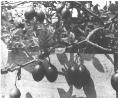
Figure 7. Fruit of tree tomato ( Cyphomandra batesca ), New Zealand.