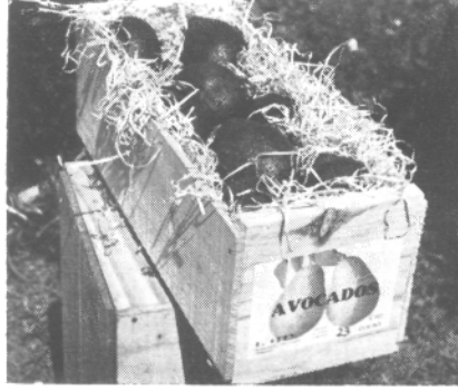
Figure 1. Commercial avocado pack, New Zealand.