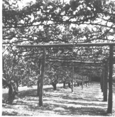
Figure 5. Chinese gooseberry trained on pergola, New Zealand.