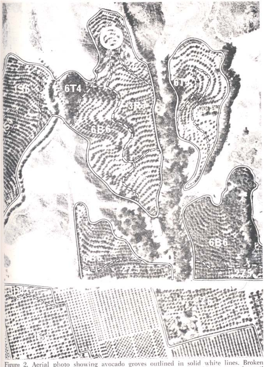
Figure 2. Aerial photo showing avocado groves outlined in solid white lines. Broken white lines outline various soils. The numbers and letters are abbreviations for soil series. The white circle is area damaged by P. Cinn. The soil here is a Rincon silty clay loam with restricted internal drainage.

Terrace breaks. The largest acreage on any one soil type was San Benito<sup>**</sup> clay loam with 251.5 acres, but there were ten soil types with less than one acre involved. The aerial photo in Figure 2 shows how this great variation in acreage is possible.