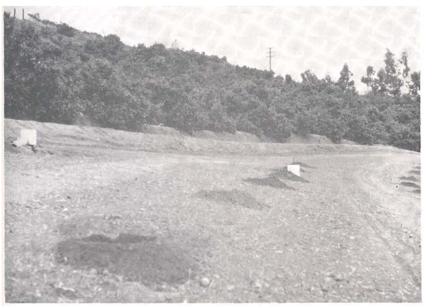
Figure 3. Avocado planting on hillside is on Pleasanton stony loam. In foreground are holes for new avocado planting, Soils here are Yolo stony fine sandy loam—area previously in lemons.

Pleasanton soils include a rather wide range in color and soil characteristics. They are developed on old alluvium on terraces (Figure 3) and valley plains. Texture ranges from loam to stony sandy loam. Color is grayish-brown or brown in the surface horizon to light-brown or yellowish-brown below three to five feet. The subsoil is somewhat more compact and is clay loam to stony clay loam in texture. The soil reaction is neutral to slightly acid.