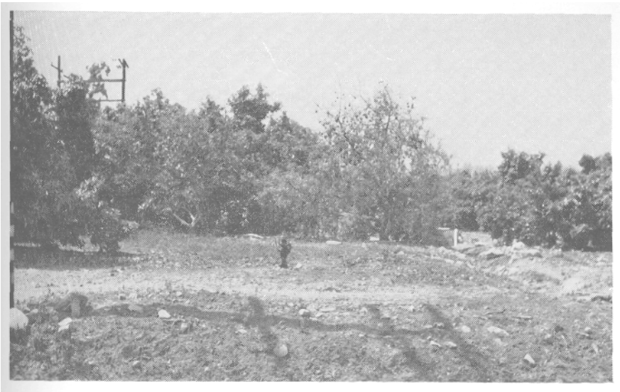
Figure 4. A root rot damaged avocado grove near Santa Paula. Four trees have been killed—note stump in foreground. Two more trees in background are dying. The soil here is a Yolo rock loam which normally has good internal drainage, but this corner was waterlogged by continuous pump overflow.

Figure 4 shows that even if avocado trees are planted in the best of well-drained soils, trees can be damaged if the fungus is present in waterlogged soils. Since this root rot area has been allowed to dry, the spread of the damage has been slowed appreciably. Under normal conditions— with this well-drained alluvial soil—excessive tree damage would not be expected. This survey has value, not only in choosing sites for future plantings, but also is helpful where root rot has already become established. Persons planning new groves should contact their local Farm Advisor and Soil Conservation Service office to help determine which soils are best suited for avocado culture and the least favorable for root rot development. For those who already have an infestation in their groves, a knowledge of the soils that are involved and the extent or boundaries of the various soil series will help in deciding the measures to be taken to either control or retard the spread of the fungus.