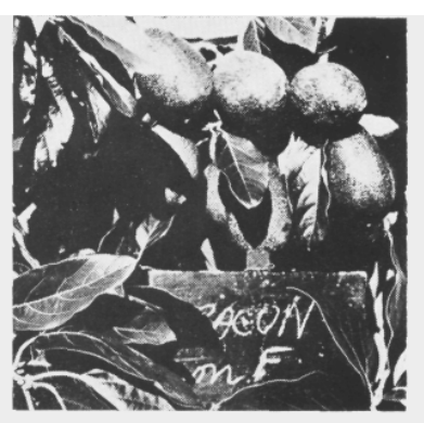
FIGURE 2. Close-up of the Bacon tree in Figure 1, showing set fruit.