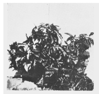
FIGURE 1. Bacon grafted on Mt 4, two years after planting. Note the spreading tree habit. Twenty fruits set.

spreading. Figure 6 is the Hass graft on Mt 4 "B" seedling; it is very stunted.