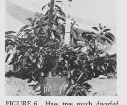
FIGURE 6. Hass tree much dwarfed by the Mt 4 "B" rootstock; it had set fruits