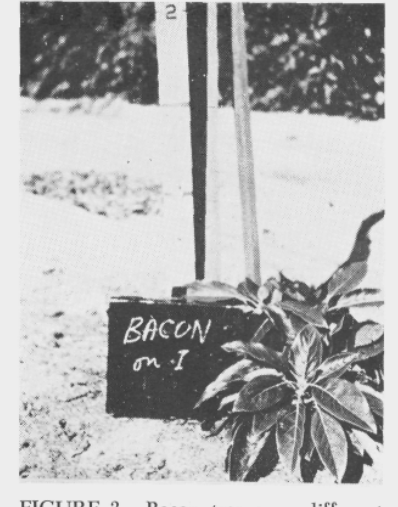
FIGURE 3. Bacon tree on a different Mt 4 rootstock, exhibiting severe dwarfing two years after planting.