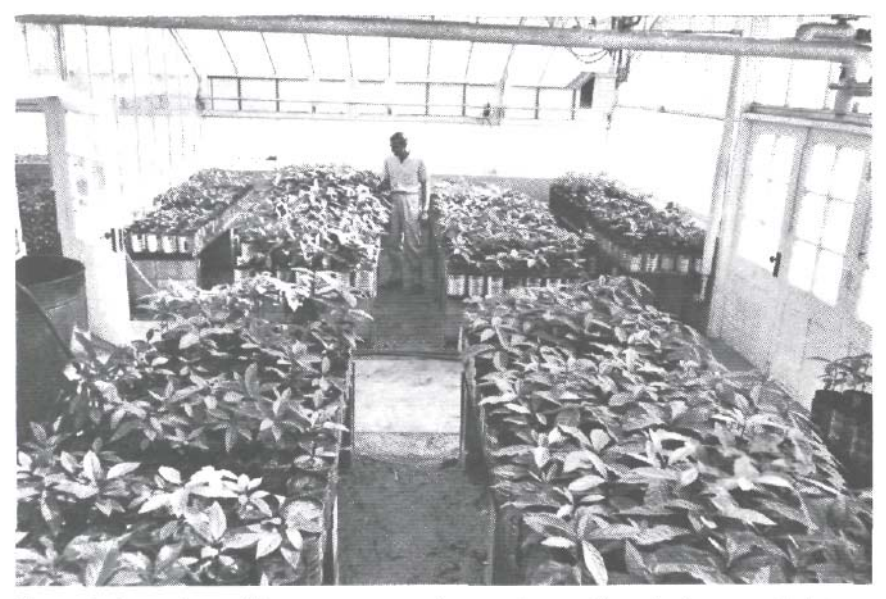
Figure 2. Avocado seedling progeny sets in greenhouse. Note in foreground that set at right has germinated much better and more uniformly than set at left. All seedlings are about 3 months from seed planting.

We have not found it practical at C.R.C. to germinate seeds in containers out of doors, except for a short period in spring. During summer and fall, the seedlings are usually killed by heat as they emerge. By the time that day maximum temperatures are more moderate, night temperatures are so low that germination is delayed and many seeds rot without sprouting. Hence our seedlings are best grown in the greenhouse. However, since greenhouse space is inadequate for our needs, we have had to try other methods. One of the most successful substitutes has been the summer outdoor growing of seedlings under elevated roofs of lumite or double cheesecloth. With very careful watering, this has worked out fairly well