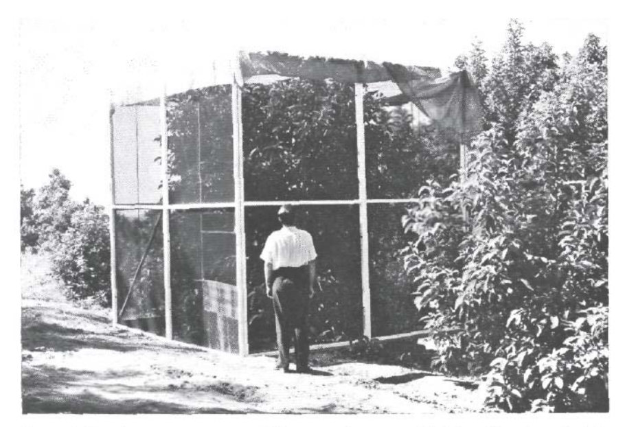
Figure 1. Lumite screen cage, containing avocado tree and beehive. Note door in lefthand corner of far side.

special interest, can be self-fertilized by bees inside a screen cage surrounding the tree. Such cages can be erected in differing sizes as needed. Figure 1 shows a cage that is a cube of 16 feet. The sides are rigid, while the top is covered with a loose sheet of the screening, tacked onto the wooden frames at the edges.