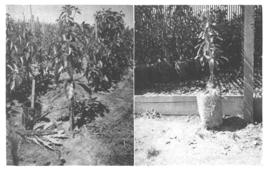
Figure 3. Bud with seedling part removed at the bud union.

The next important step is selection of the best possible budwood of the desired variety. The parent tree must have good bearing habits and must certainly be free from sunblotch or other diseases as it is hoped the nursery trees will be duplicates of the parent in all phases. Buds chosen are inserted under the bark by standard budding procedure and wrapped in place with a plastic strip. The top of the seedling is cut partly back to check the terminal growth and to help force the bud. From here on special nursery experience is necessary to develop the bud into a sturdy well shaped tree. The seedling part is periodically cut back and eventually cut off entirely at the union to leave the new budling as the new tree. This period usually takes from 8 to 15 months Just before the tree bailer takes over to dig and wrap the tree the leaves and side branches are cut back to balance the root system that will be left in the ball. The balled tree is generally kept in a lath house for about 2 weeks before planting. Careful culling of any and all trees that do not measure up to high standards is carried on during the entire growing period to insure that only the finest trees remain.