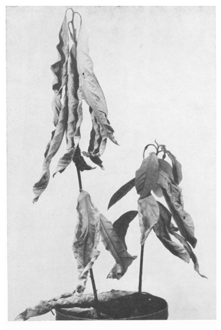
Fig. 3. Guatemalan (left) and Mexican avocado seedlings inoculated by dipping roots in spore and mycelium suspension of v. albo-atrum. Photo taken 4 weeks after inoculation.

Inasmuch as a rather resistant variety of tomato was used, symptoms were not obvious on tomato, but some one-sided yellowing of leaves did occur, and V. albo-atrum was re-isolated from the faintly discolored portions of the petioles and stem.