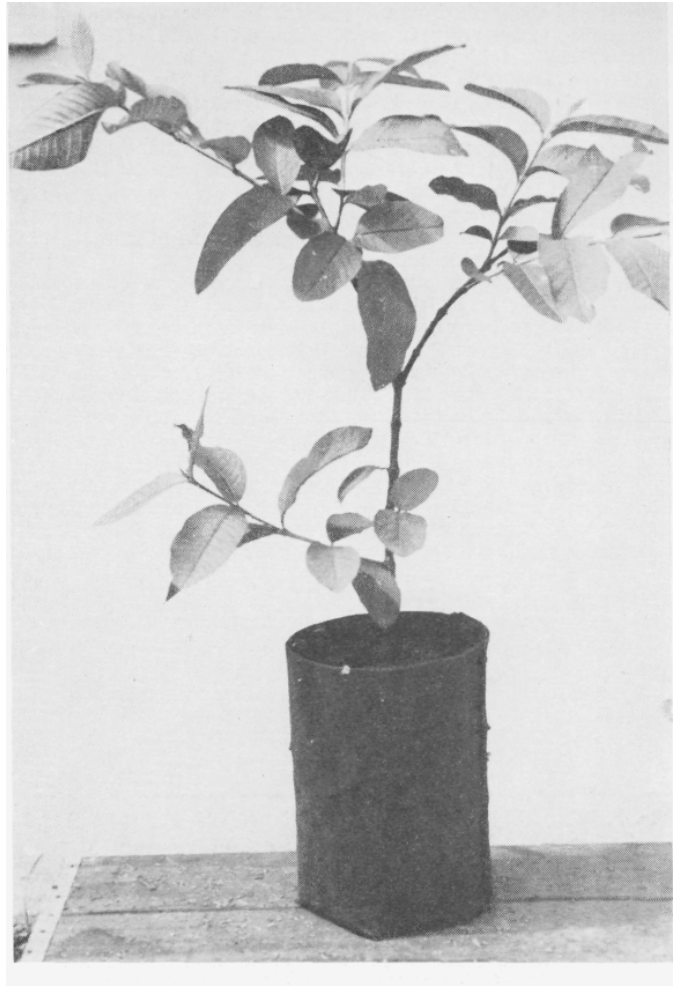
Fig. 5. Layered tree five months from the time the branch was girdled and the girdled area wrapped. It has been hardened off and is ready for planting in the field.

A piece of newspaper or wrapping paper tied loosely over the wrap (Fig. 1) prevents birds from pecking holes through the plastic and also prevents the moistened moss from overheating from the sun's rays directly striking the plastic. The plastic film allows passage of respiratory gases but retains moisture. The wrap is left attached until sufficient roots can be observed through the plastic. Usually they begin to form in three to five weeks. If they do not begin to show after six weeks, the wrap should be removed and the girdled area examined. In some instances callous grows over the girdled area before root development begins. Regirdling and re-wrapping usually is followed by root formation in a few weeks.