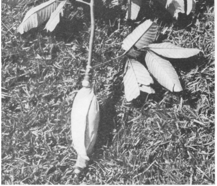
Fig. 2. Layered branch removed from parent tree after roots appear under plastic wrapper.