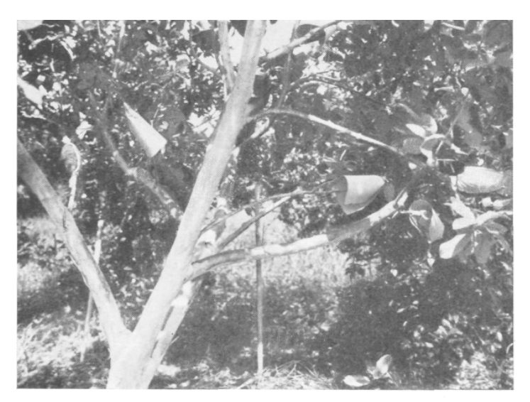
Fig. 1. Air-layering from bearing guava tree.