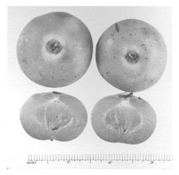
Fig. 3. Oblate form of Kei apple fruit.