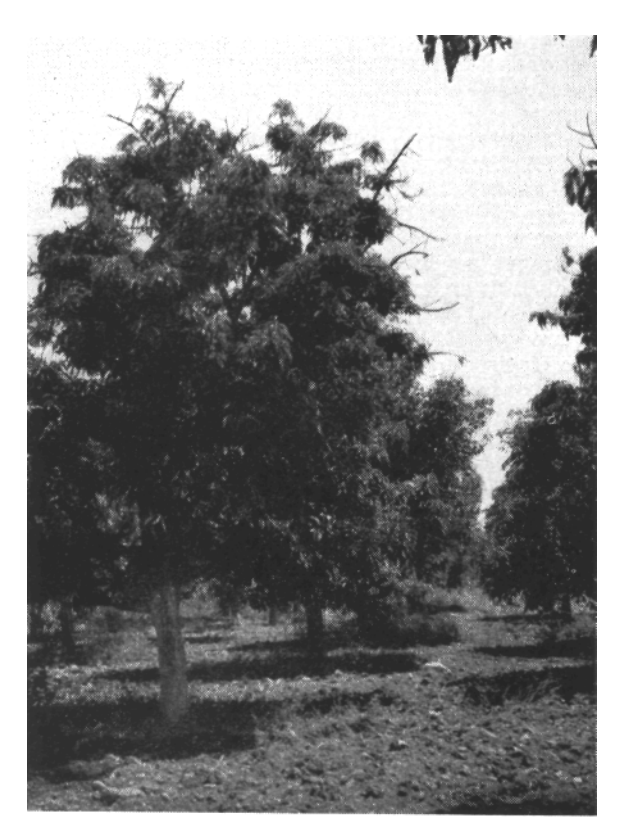
Rodiles Seedling Avocado Orchard near Atlixco, Mexico