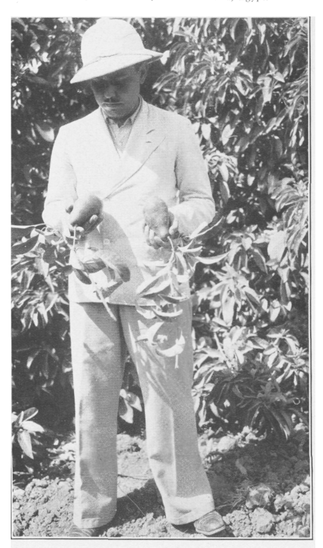
Fruits of the Fuerte at Giza.