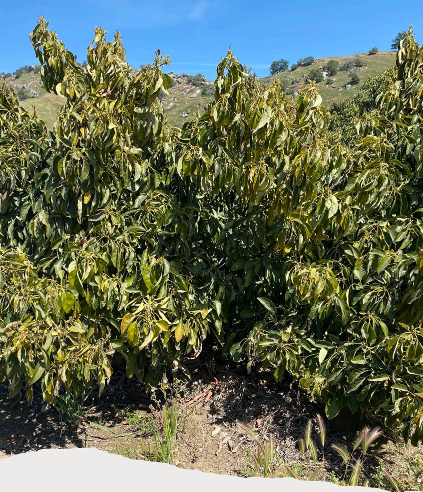
Poor drainage severe waterlogging