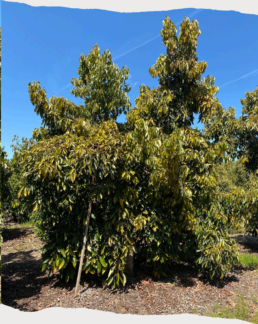
Intermediate drainage moderate waterlogging