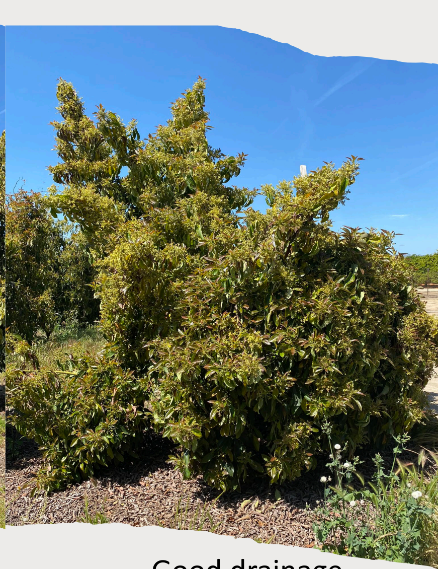
Good drainage mild waterlogging