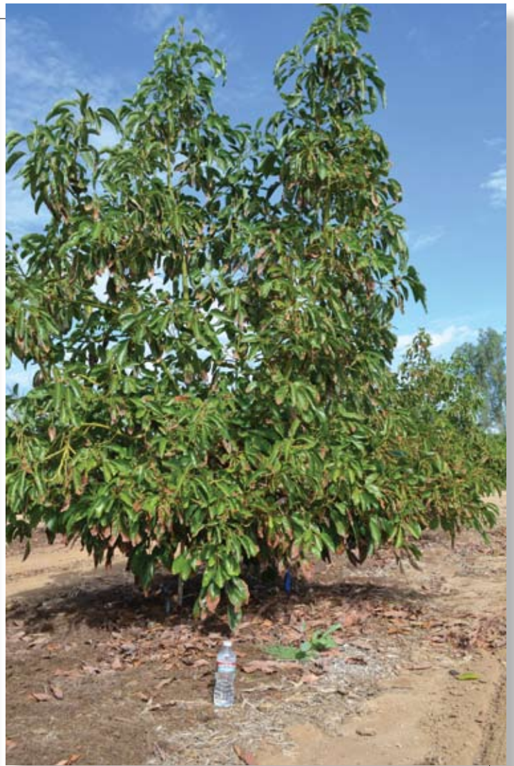
Figure 1. R0.05 fresh water (left) and salt treated (right). Overall survival rate in salt treated row was 66.67 percent. Photo taken in 2015.

rootstocks such as R0.06, R0.07, PP14 and R0.17. Salt sensitive rootstocks had high chloride and sodium concentrations in the leaves and also were the least salt tolerant with 100 percent mortality in the salt treated rows irrigated with saline water for 23 months. The rootstocks R0.05, Dusa, PP40 and R0.18, accumulated the least amount of chloride in the leaves and were also the rootstocks that accumulated the lowest amount of chloride in the roots. This indicates that chloride exclusion is occurring at the root interface. This experiment shows, under field conditions, the influence of rootstock on the concentration of chloride and sodium and other