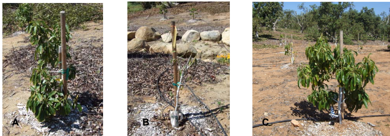
Figure 2. A) Brandon rootstock grafted with Hass growing under heavy root rot conditions. B) Thomas rootstock grafted with Hass showing significant symptoms of avocado root rot. C) Eddie rootstock grafted to Hass growing under heavy root rot conditions. Thomas rootstock grafted with Hass in the background is showing significant symptoms of avocado root rot.

additional locations in the avocado production areas. Unfortunately, two of the newly tested lines, Balou1 & 2, performed the worst. Therefore, they will likely be dropped from further testing. In the past, poorly performing varieties were often tested over many years. One of the varieties was ordered again for one more trial and if it fails, we will drop both of these so that other advanced lines can be field-tested. We currently have over 40 advanced lines that have undergone approximately two years of greenhouse screening for root rot resistance that have not been field tested and 16 have been generated since I took over as lead PI. All of these advanced lines came from our breeding blocks on the University of California campus (Table 3).