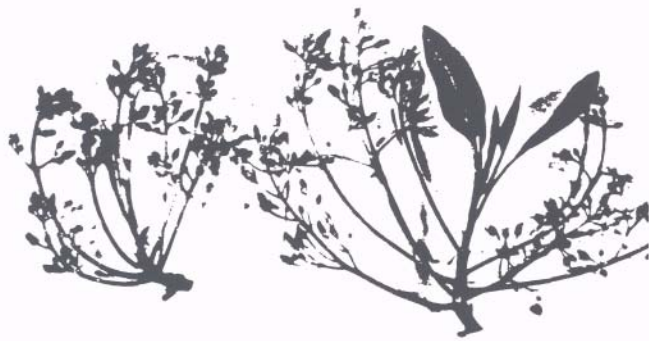
Figure 2 - Control (untreated) indeterminate inflorescence exhibiting normal vegetative shoot development (left) and precocious vegetative growth of inflorescences produced by summer shoots treated with GA 3 (100 mg/liter) on January (right). Picture taken on 5 March 1994.